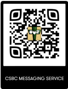
CSBC MESSAGING SERVICE