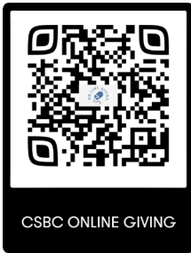
CSBC ONLINE GIVING