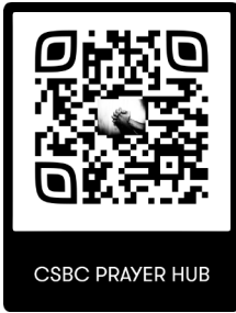
CSBC PRAYER HUB