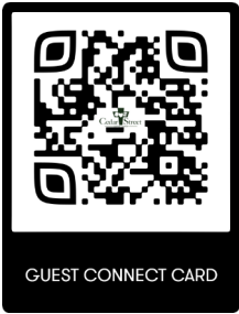
GUEST CONNECT CARD