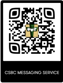
CSBC MESSAGING SERVICE