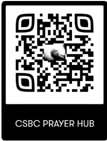
CSBC PRAYER HUB