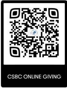
CSBC ONLINE GIVING