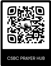
CSBC PRAYER HUB