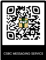
CSBC MESSAGING SERVICE